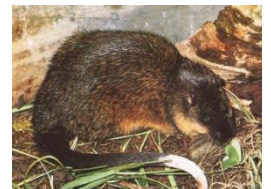
Dhurruyamba (Water rat)