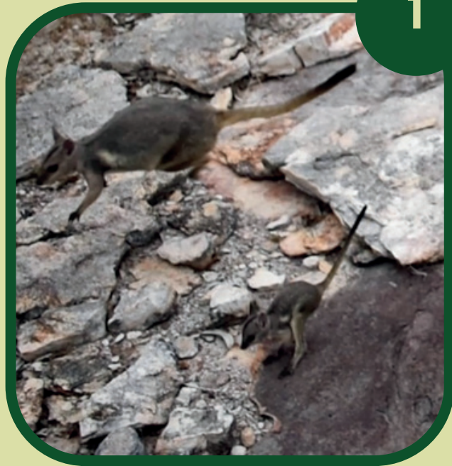
Gaṭala Eastern Short-eared Rock Wallaby