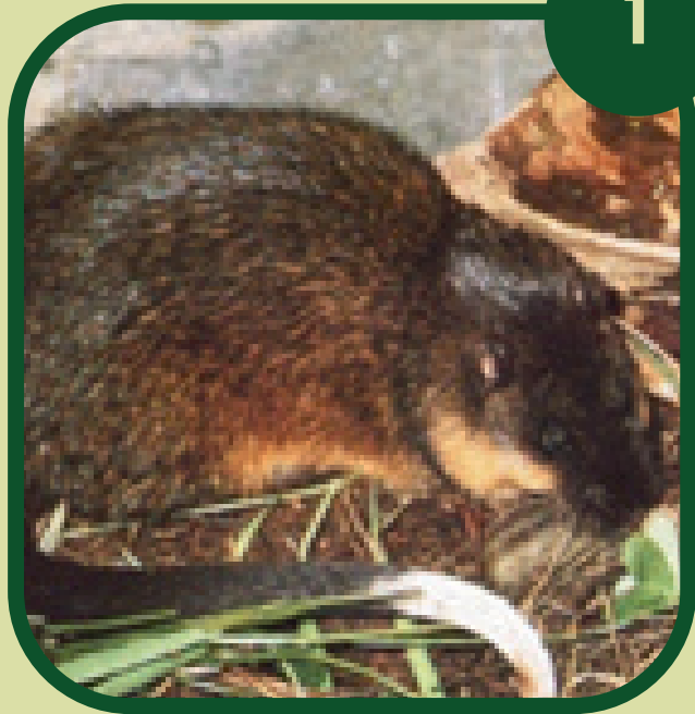
Dhurruyamba Water Rat