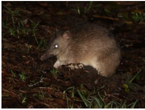
Wan'kurra (Northern Brown Bandicoot)

These animals were a concern across all 6 meetings and interviews