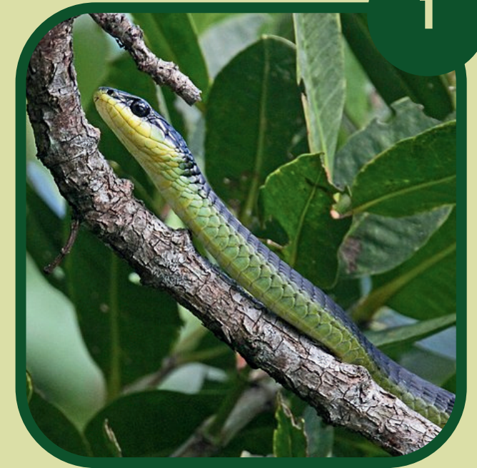
Garananga' Common Tree Snake