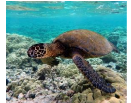
Miyapunu (Sea turtles species) All listed in NT or Nationally

These animals were a concern at 1 meeting and are threatened in the NT