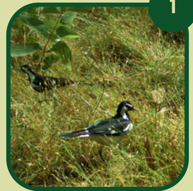
Delili Magpie Lark