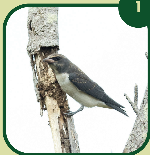
Muḷunda White-breasted Woodswallow