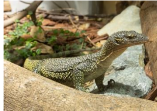
Min'djirtjirr (Mangrove monitor)