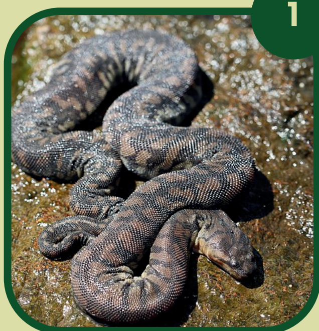
Djaykuṅ' Arafura File Snake