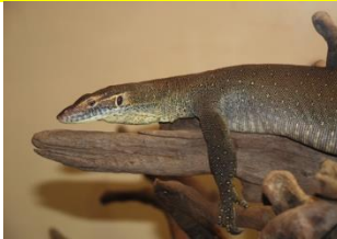
Wan'kawu (Merten's water goanna) Vulnerable NT

These animals were a concern across 3 meetings and interviews