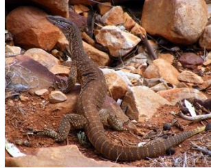
Dilkam/Biyay' (Sand Monitor)