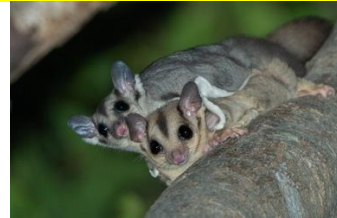
Wäraŋ (Savanna glider)

These animals were a concern across 2 meetings and interviews