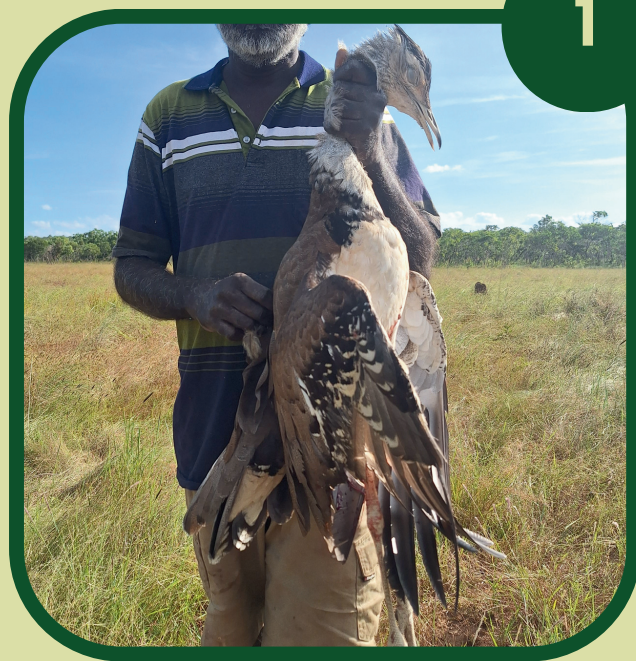
Buwata Australian Bustard