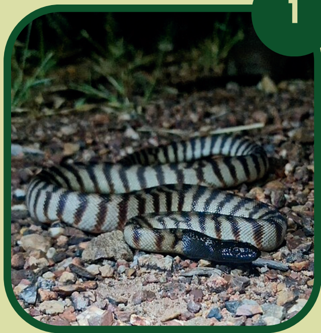
Gununu' Black Headed Python