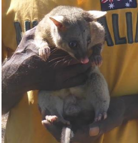
Rupu/Marrŋu (Northern Brushtail Possum) Vulnerable EPBC

These animals were a concern across 4 meetings and interviews