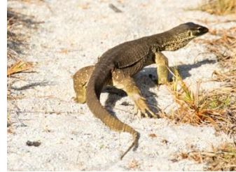
Djanda (Yellow-Spotted Monitor) Vulnerable NT

These animals were a concern across 3 meetings and interviews