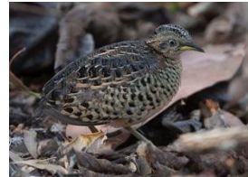
Djirikitj (Brown quail, Red-backed button quail)