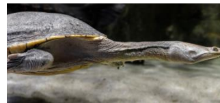
Minhala (Northern Snake-necked Turtle) Near Threatened IUCN