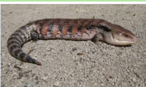
Dhamaliŋu (Northern blue-tongued lizard) Critically endangered EPBC

These species were a concern at 1 meeting and are not threatened in the NT or Nationally