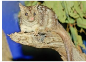
Barkuma' (Northern Quoll) Critically Endangered NT