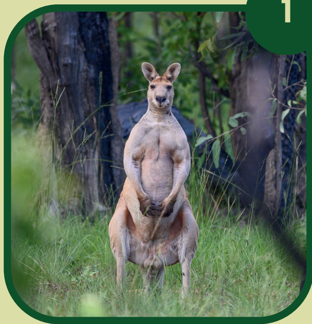
Garrtjambal Antilopine Wallaroo