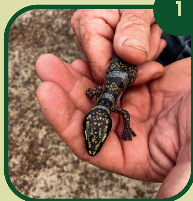
Munhaṅaniṅ' Marbled Velvet Gecko