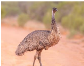
Małwiya (Emu) Near Threatened NT

These animals were a concern at 1 meeting and are threatened in the NT