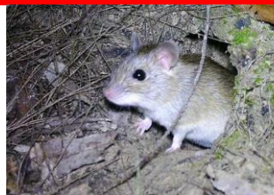
Nyumukuŋiny ga Bathala Nyiknyik (Small and Large Rodents) Some Vulnerable or Endangered