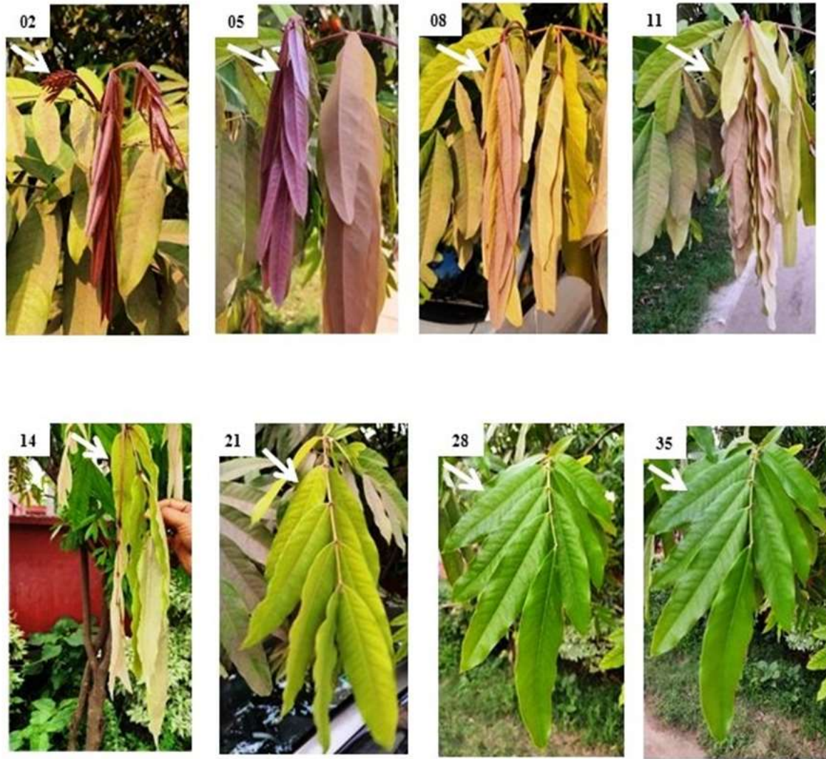
Fig. S1. The pattern of leaf growth and colouration of S. asoca during 35 DAOL.