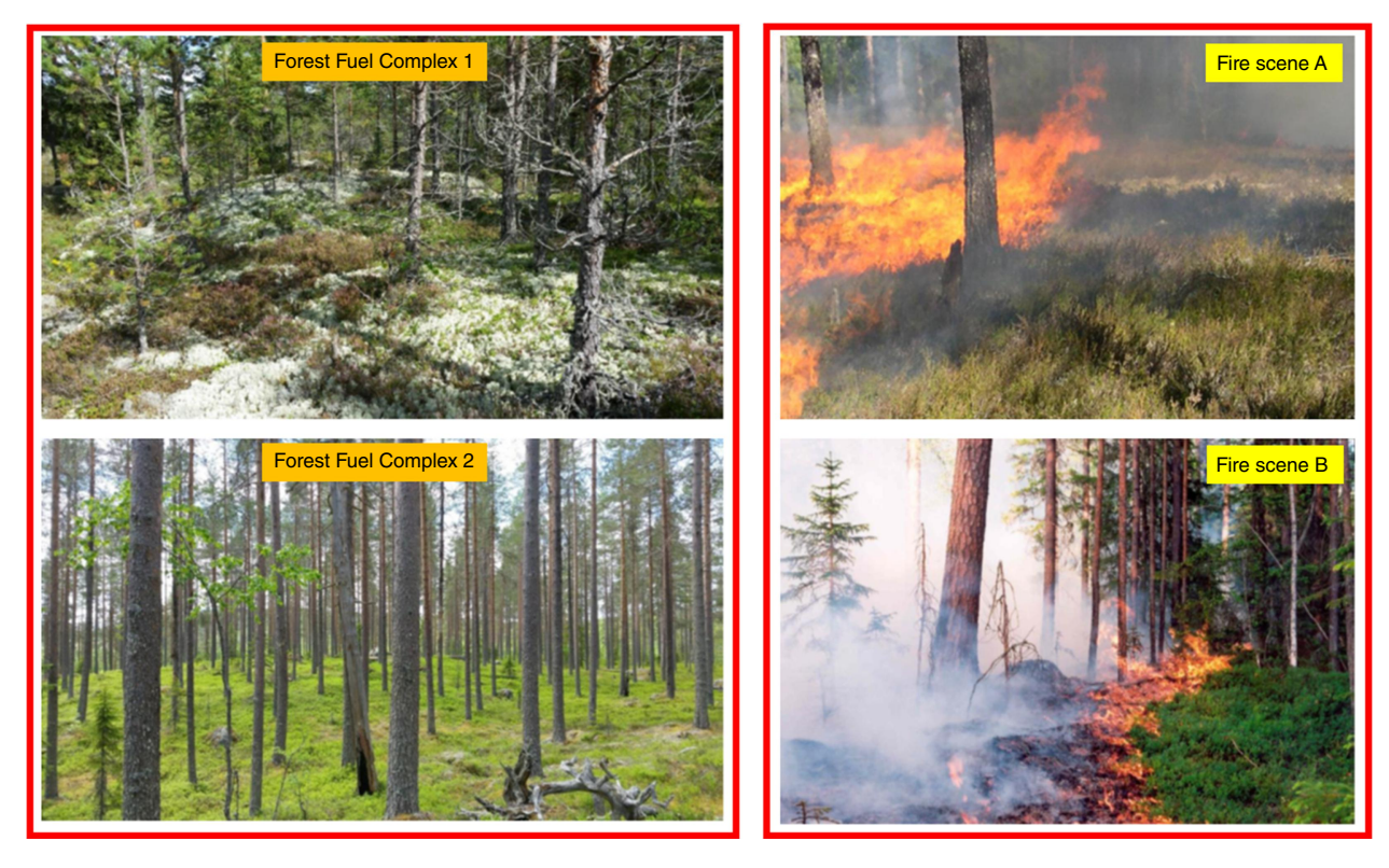
Fig. 1. Left: forest fuel complexes presented to ICs for grading potential fire behaviour. Right: fire scenes (scene A, headfire; scene B, backing fire) for assessing ROS.