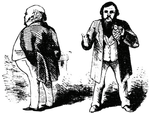
Fig. 4. Melbourne Punch 1 April 1858, p. 81. Poem and cartoon satirising the fish naming controversy.

I tell you zat I had no thought To say zat vot I did'nt ought; It vos no part of mein own wishes, To miscal men while naming vishes.