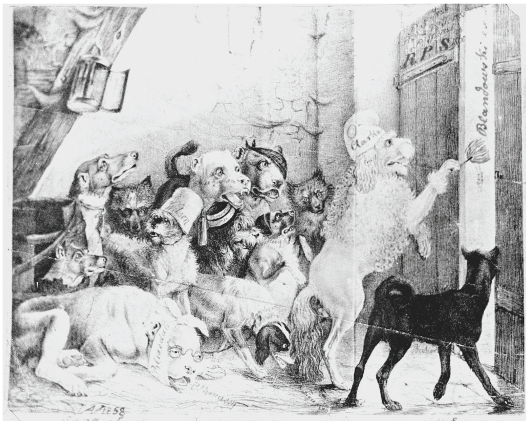
Fig. 3. Cartoon of Blandowski and the Royal Society.