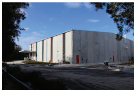
New drill core storage facility at Zillmere.

Queensland's resources exploration industry now has easier access to drill core thanks to a $5 million expansion of the Queensland Government's Exploration Data Centre (EDC) at Zillmere on Brisbane's north side.