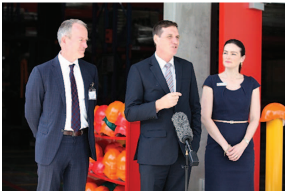
Queensland's Chief Government Geologist, Tony Knight (left), the Queensland Minister for Natural Resources and Mines, Anthony Lynham, and the State Member for Nudgee, Leanne Linard, at the official opening of the new storage facility.

68 Pineapple Street, Zillmere, Qld 4034 Telephone: +61 7 3096 6810 Facsimile: +61 7 3096 6817 Mobile: 0408 887 685 Facebook: Mining Qld Twitter: @miningqld https://www.business.qld.gov.au/industry/mining/mining-online-services https://www.business.qld.gov.au/industry/mining/geoscience-data-information/core-rock-collections