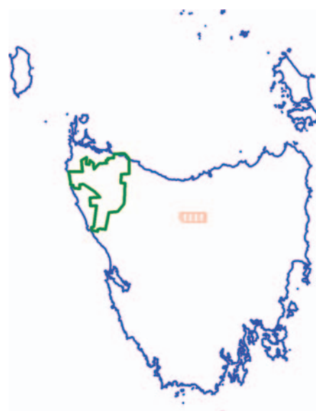
Fig. 2. General locality diagram for the Mole Creek magnetic and radiometric (red) and Northwest Tasmania gravity (green) survey areas (also see Tables 1 and 2 respectively).