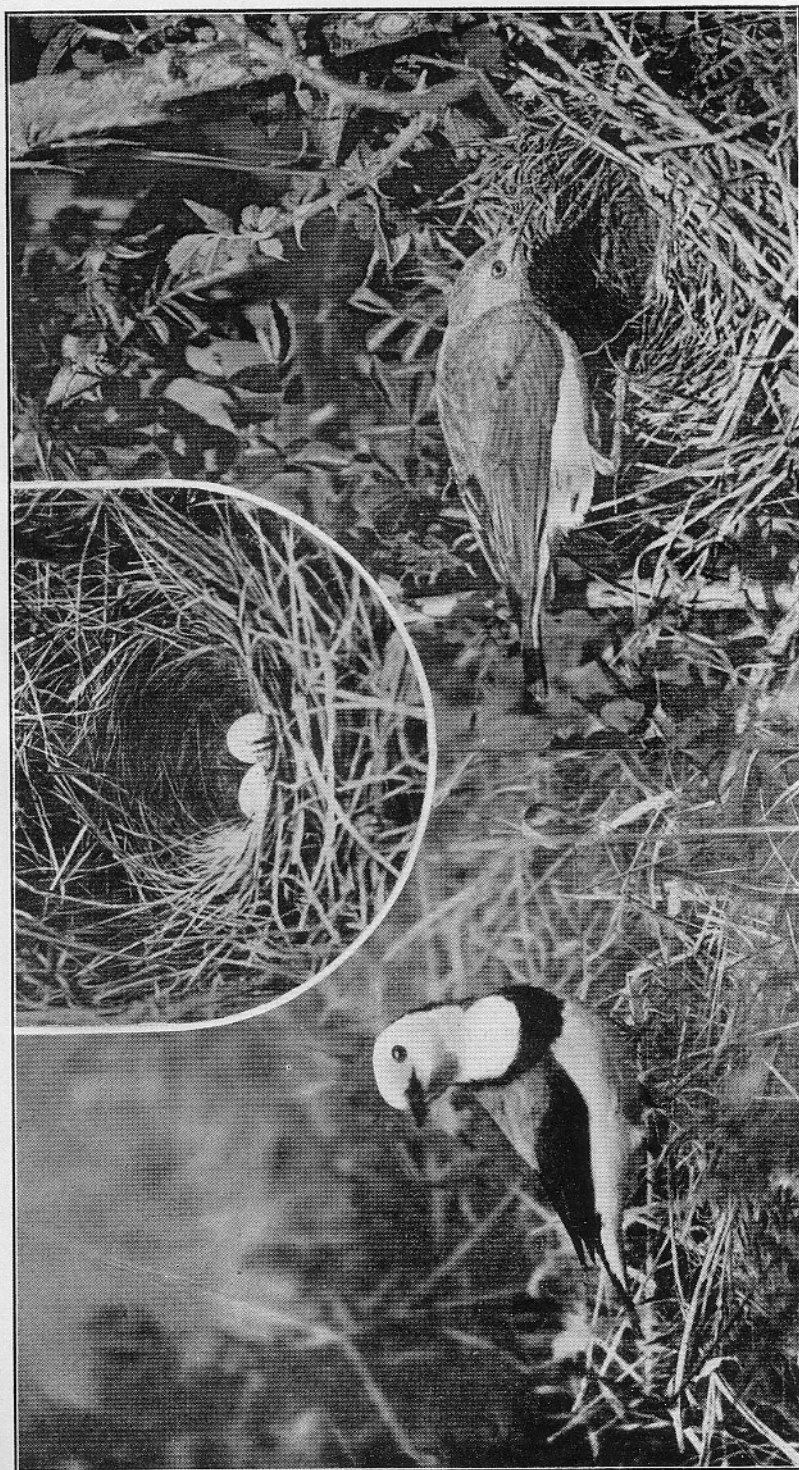
White-fronted Bush-Chat ( Ephthianura albifrons ) and Nest. Female.