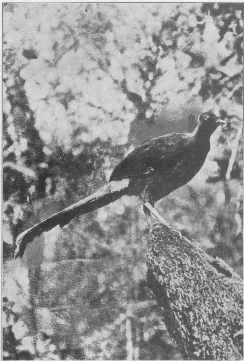
Female Lyre-Bird, Poowong, Gippsland.