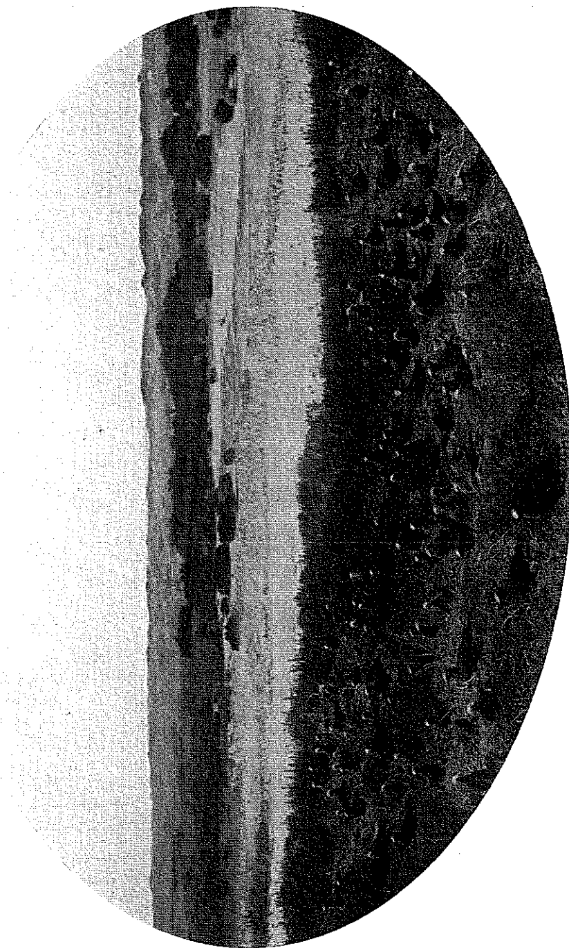
Noddies Nesting, Pelsart Island, Abrolhos.