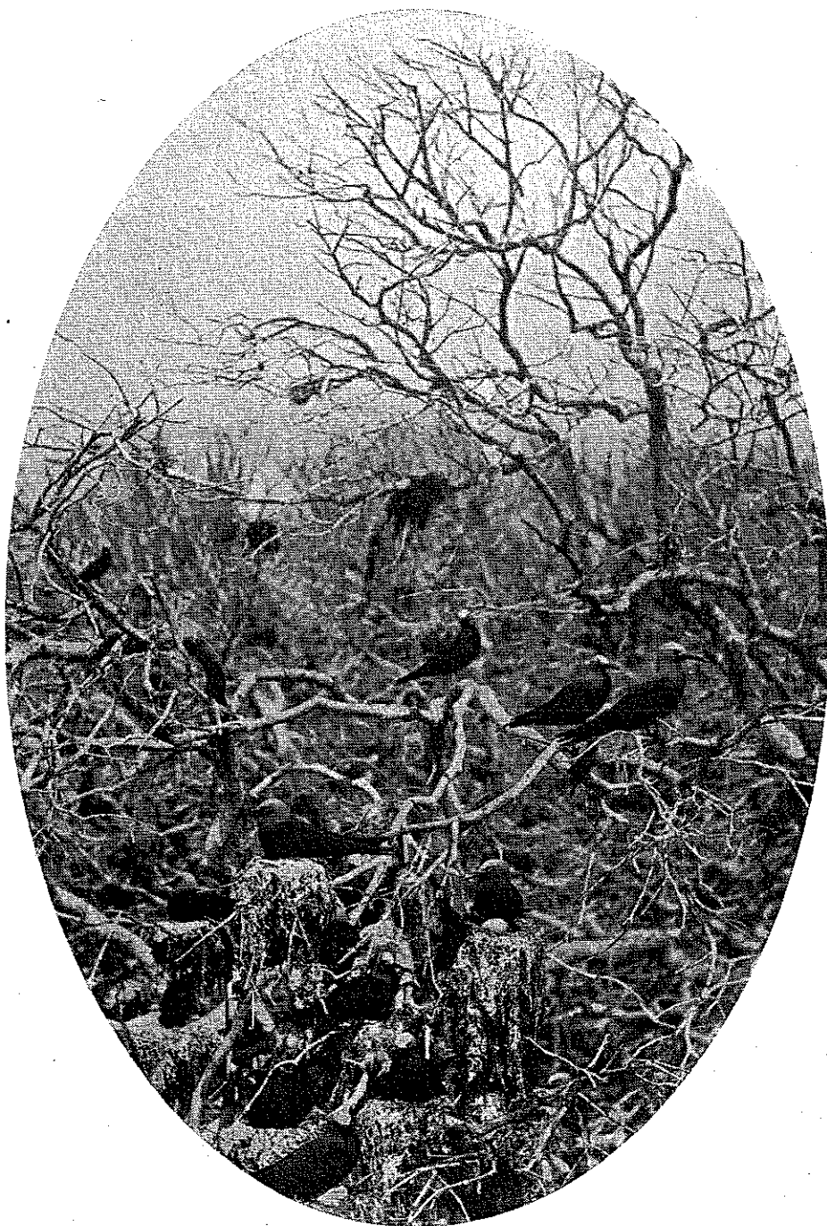
Lesser Noddies Nesting in Mangroves, Wooded Island, Abrolhos.