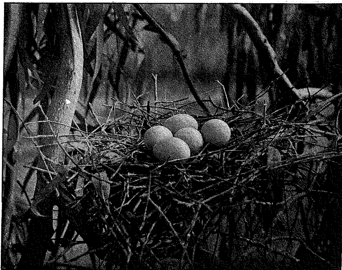
Nests of White-fronted Heron ( Notophox nova-hollandiae ).

(1) With young and egg just chipped (2) With eggs