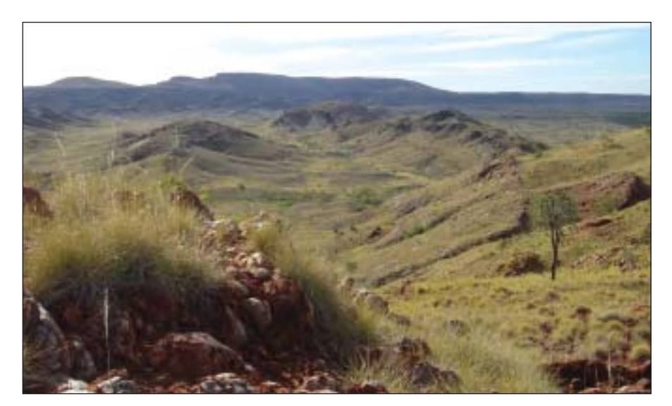
Figure 1. The Pilbara study area. The Strelley Pool Chert was originally deposited as a horizontal layer, but has since been tilted around 90° so that it now dips vertically and stands high as a ridge (at right, curving back and in toward the rear centre of the picture). A person walking along the ridge can see unusual conical structures – interpreted as stromatolites – along most of the ridge length. The abundance and excellent preservation of the stromatolitic (?) outcrop provides exceptional opportunities to study what may be the oldest evidence of life on Earth.

In 2003, PIMA was used to seek evidence of hydrothermal activity in the Strelley Pool Chert. The spectra of black cherts in