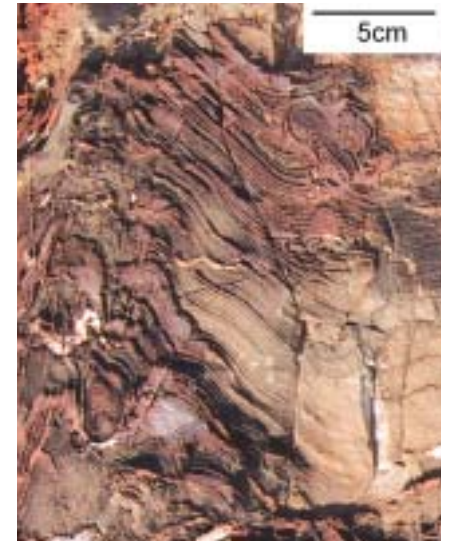
Figure 2. A stromatolite in the 3.5 billion year old rocks of the Strelley Pool Chert. Note the conical shape and branched feature on the upper right flank. Those features are best explained by microbial influence during deposition of the fine sedimentary laminations.

Figure 1. The Pilbara study area. The Strelley Pool Chert was originally deposited as a horizontal layer, but has since been tilted around 90° so that it now dips vertically and stands high as a ridge (at right, curving back and in toward the rear centre of the picture). A person walking along the ridge can see unusual conical structures – interpreted as stromatolites – along most of the ridge length. The abundance and excellent preservation of the stromatolitic (?) outcrop provides exceptional opportunities to study what may be the oldest evidence of life on Earth.