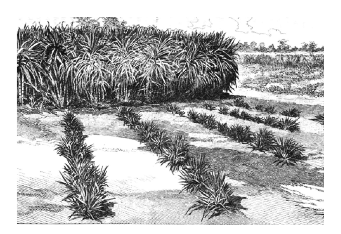
Fig. 2. Drawing of sugarcane stools planted from healthy (background) and diseased setts (foreground), After Cobb (1905), fig. 11, https://babel.hathitrust.org/cgi/pt?id=hvd.hxj1jc&view=1up&seq=151&q1=GUMMING 109.

of the top parts of the stalks, shooting of the buds at the top of the stalk, internally red patches of tissue spreading from the buds up and down the stalk and rotting of the roots. 7 He had sent samples to 'the plant pathologist' (presumably Nathan Cobb, the New South Wales vegetable pathologist) who found that there was no 'widespread' fungus. Despeissis concluded that the disease was caused by insects including the clavicorn beetle (probably the fungus-eating Brachypeplus binotatus) that burrowed into the stalk and induced local fermentation of the tissue, the resulting poison spreading throughout the stalk. O'Kelly wrote a report of his findings in the same issue of the Agricultural Gazette of New South Wales and also concluded that borer insects were the most likely cause, attacking the top of the plant and working their way down the stalk. He provided further details of the symptoms, noting that the older leaves 'closed up' at the top of the stalk and the inner, developing leaves (a symptom that he called arrowing) became twisted and distorted before dying.