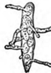
Fig. 4. The eight ascospores of an ascus of S. destructiva germinating, and sending their hyphae through the wall of the ascus; x 400.

Fig. 1. Illustrations of Sphaerella destructiva , Cobb (1892), pp. 107–108, https://babel.hathitrust.org/cgi/pt?id=uiug.30112112405409&view=1up&seq=193 and https://babel.hathitrust.org/cgi/pt?id=uiug.30112112405409&view=1up&seq=194 .