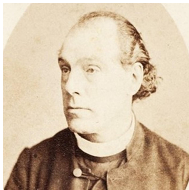
Fig. 2. Reverend Julian Edmund Tenison-Woods, 1880, photographer H. H. Baily, State Library of New South Wales, https://collection.sl.nsw.gov.au/record/nmQddjBn#viewer .

If high quality DNA can be extracted from this single specimen of S. destructiva that was collected over a hundred years ago and now deposited in BRI, as well as from some other specimens of Ps. medicaginis , the taxonomic status of the former and its relationship (if any) with Ps. medicaginis could be determined with accuracy.