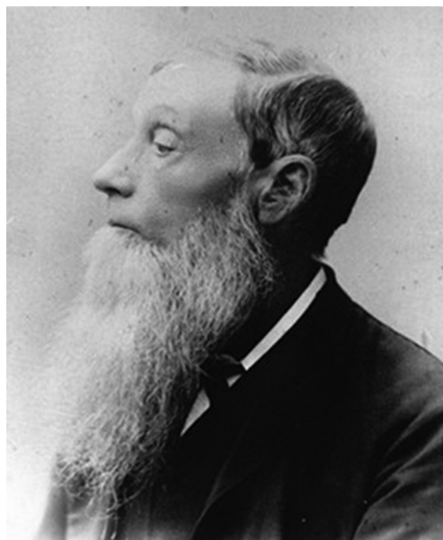
Fig. 3. Mr Frederick Manson Bailey, no date or photographer