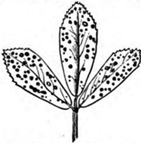
Fig. 1. Lucerne leaf attacked by the fungus, Sphaerella destructiva .