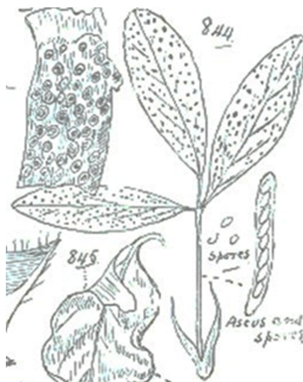
Fig. 4. Illustrations of symptoms and signs of Pseudopeziza medicaginis on lucerne leaves, and ascus and ascospores, # 844, after Bailey (1909) p. 760, https://www.biodiversitylibrary.org/item/123358#page/800/mode/lup .