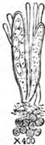
Fig. 3. Asci or fruiting sacs of Sphaerella destructiva , with five paraphyses.