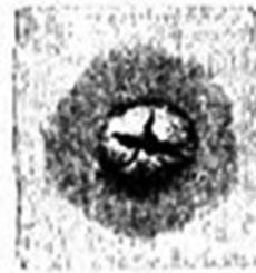
Fig. 2. Pustule of the fungus Sphaerella destructiva x 50.