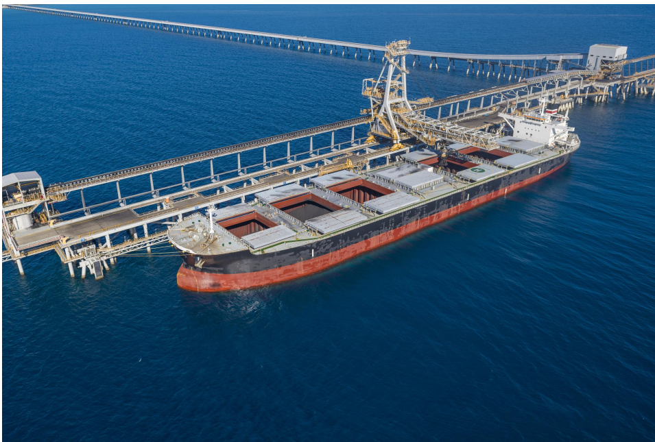
Fig. 5. A coal ship at Abbot Point terminal in Bowen, central Great Barrier Reef.