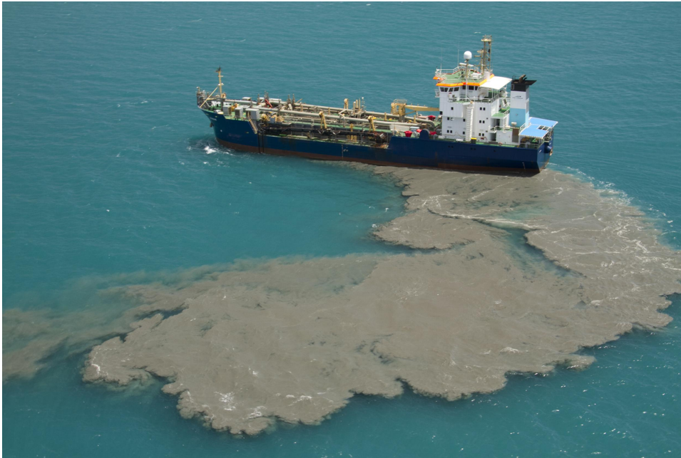
Fig. 4. Brisbane , a cutter suction dredge barge, dumping dredge material from the Port of Cairns in the Great Barrier Reef World Heritage site.