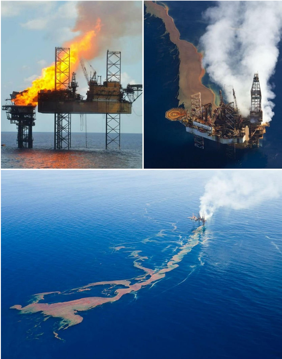
Fig. 6. The Montara offshore oil platform and drilling rig in the Timor Sea off Western Australia, spewing uncontrolled oil and gas for 7–8 weeks after a blow out in August 2009.

to ongoing calls for an inquiry into the Montara spill and for an evaluation of the approval process for offshore oil and gas activities around the sensitive coral reefs of the region, including those in Cartier Island Marine Reserve, the Ashmore Reef National Nature Reserve, Hibernia Reef, Scott Reef, Rowley Shoals and the Kimberley and Pilbara coastlines.