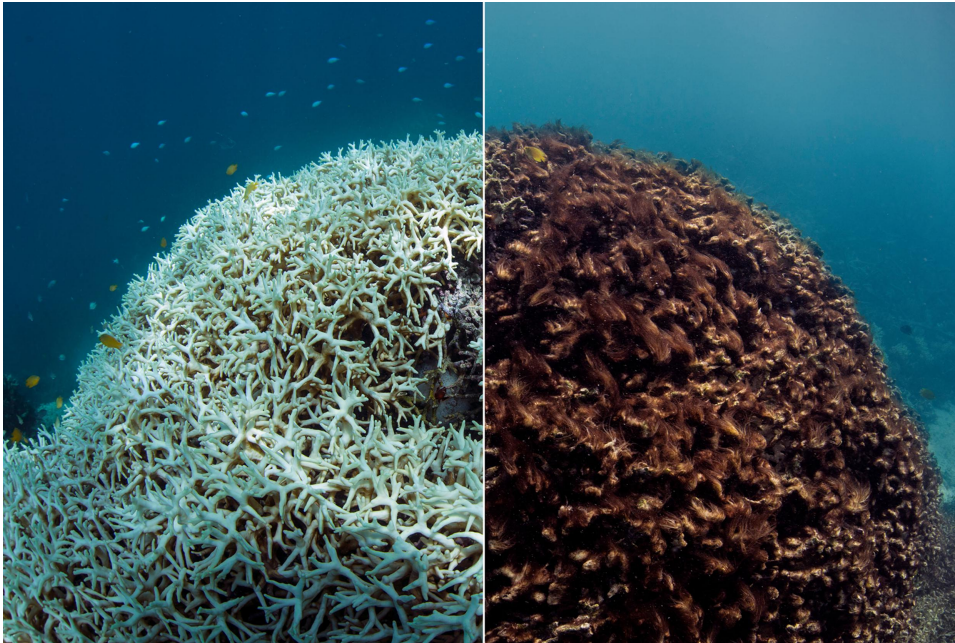
Fig. 7. Bleached branching corals lose their colour and turn white. In the absence of recovery of their brown symbionts ( Symbiodinium ), they die and are overgrown by brown algae.

regulate Commonwealth Waters for safety, well integrity, environmental management and day-to-day petroleum operations. The authority also took on responsibility for monitoring the distribution and fate of spilled oil, as well as impacts on marine wildlife, shoreline ecology and fish catches in nearby coastal and offshore marine environments.