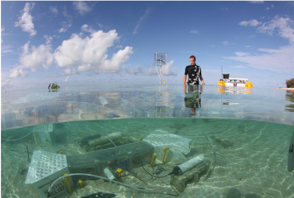
Fig. 8. The Free Ocean CO 2 Enrichment (FOCE) experiment to test the effects of ocean acidification at Heron Island.

along some of Western Australia's more remote coastlines, this consortium of reef island stations expanded to other areas of Australia, including the Kimberley Marine Research Station (Cygnet Bay, est. 2009) and the Coral Bay Research Station (Ningaloo, est. 2007). These research stations began reporting their activities and observations to a broader body of members through the annual ACRS newsletter. Avenues of research increasingly opened up to elucidate how warmer seas and acidifying oceans influence corals (Fig. 8).