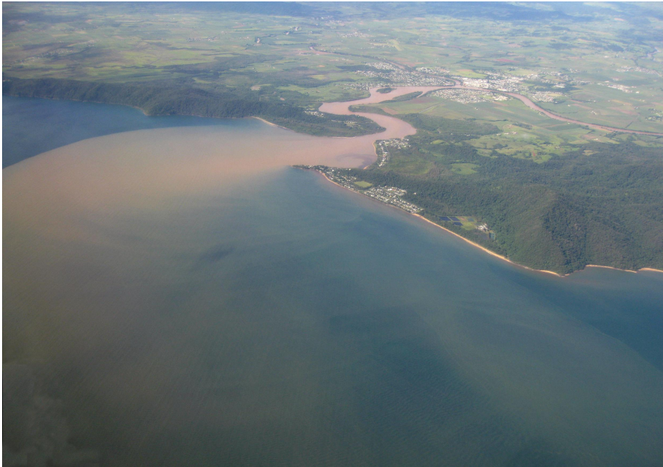
Fig. 3. Johnstone River flood plume on the central Great Barrier Reef.

coastal rainforest had been cleared for farming (Fig. 3). Land use was affecting water quality as fine sediment and bacterial flocs known as marine snow were appearing on reefs adjacent to intensive agriculture. Flood plumes were reducing coral abundance and possibly also amplifying the reproductive success of Acanthaster (Crown of Thorns starfish), a subject on which the GBRC had been vocal in the 1960s–70s. 24 Water quality became a dominant concern relating to impacts on coral communities.