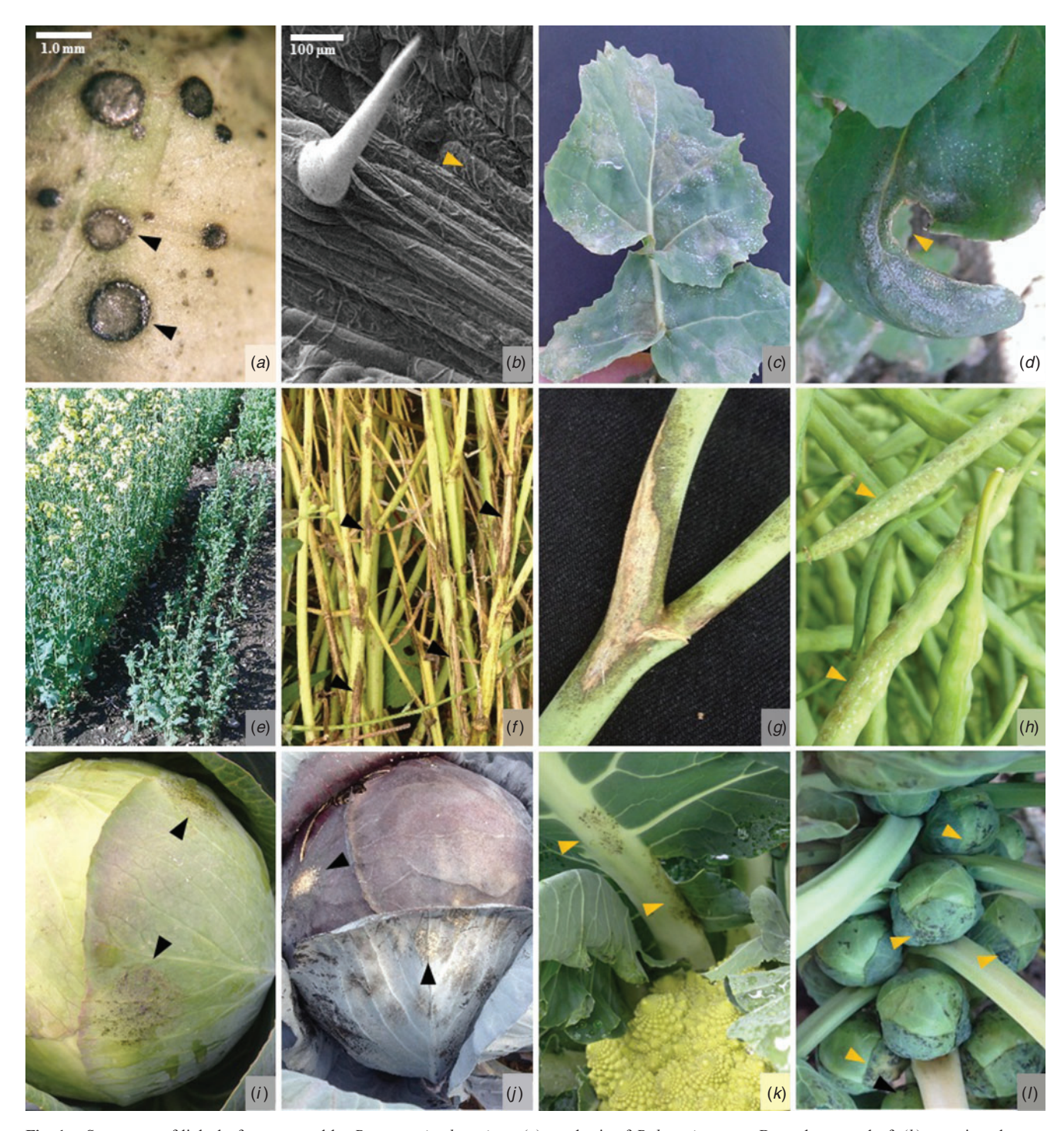
Fig. 1. Symptoms of light leaf spot caused by Pyrenopeziza brassicae : (a) apothecia of P. brassicae on a Brussels sprout leaf; (b) scanning electron micrograph of leaf section from Brassica napus cv. Apex (susceptible), showing abundant P. brassicae subcuticular hyphal growth on a leaf vein and surrounding tissue; (c) B. napus leaf with light leaf spot lesions showing discoloration of affected leaf areas and formation of acervuli; (d) B. napus leaf showing distortion at tip due to infection by P. brassicae ; (e) susceptible cultivar showing stunting due to light leaf spot (right) next to a less affected cultivar (left) with normal crop height in Scotland; (f) B. napus stems with extensive light leaf spot symptoms; (g) light leaf spot on B. napus stem; (h) light leaf spot on B. napus pods showing formation of acervuli; (i) light leaf spot on white cabbage B. oleracea convar. capitata var. alba ; (j) red cabbage B. oleracea convar. capitata var. rubra ; (k) Romanesco broccoli B. oleracea convar. botrytis var. botrytis ; and (l) Brussels sprouts B. oleracea var. gemmifera (described symptoms are marked with arrow heads).